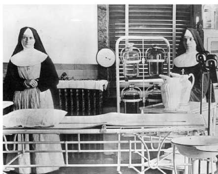
Operating Room St. Mary's Hospital

years. This continuing education program has afforded attendees the opportunity to learn about the multi-disciplinary approach to treat complex oral cases that on the surface may simply appear to be crooked teeth. While these